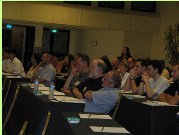
Participants attending MSW 2006 oral presentations