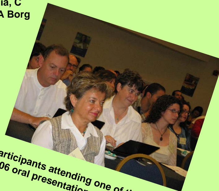
Participants attending one of the MSW 2006 oral presentations